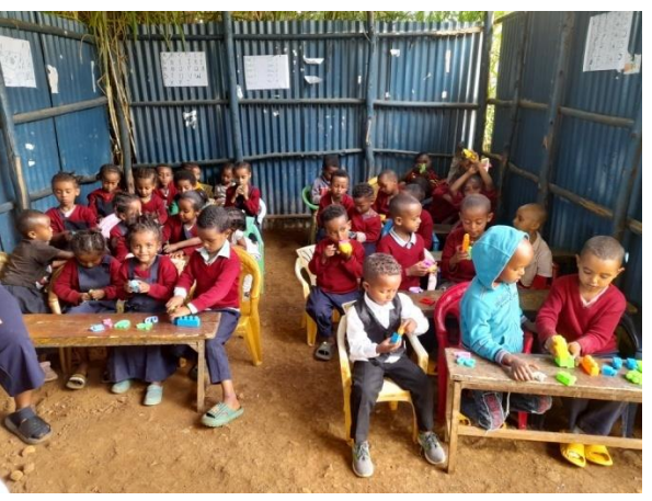
Kids in their class room playing with materials