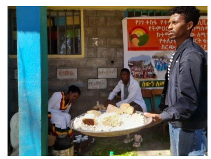
A Coffee ceremony had taken place during the session