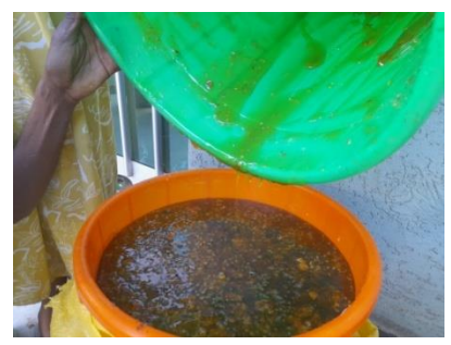
The collected honey production within the quarter