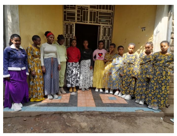
Some of the group-home boys and girls with their new dresses