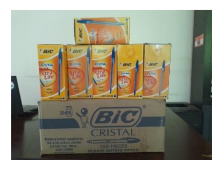
Some of packed exercise books and pens, before being delivered to students in different schools