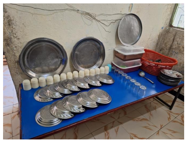
Well cleaned and displayed utensils of the kids