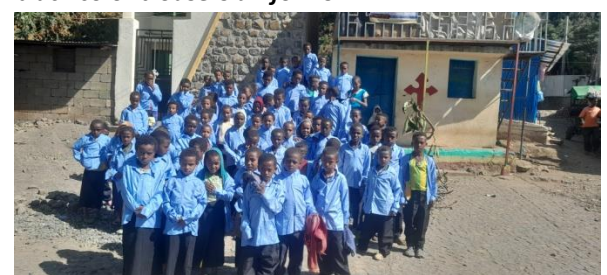
The 75 students of Kulqualgie Elementary School students with the new school uniforms