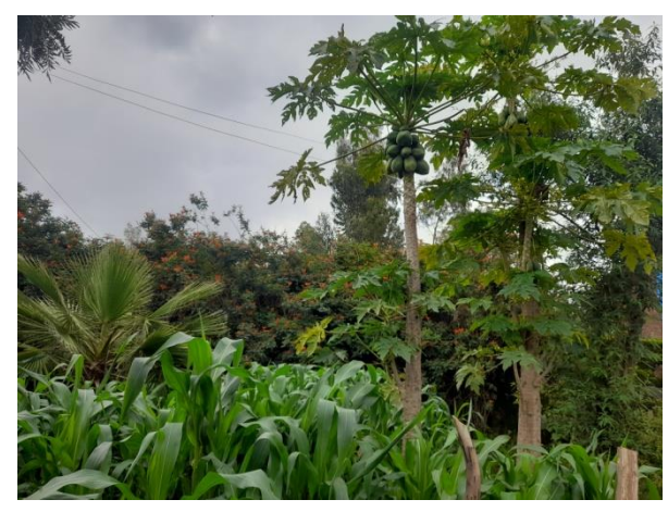
Maize crop while growing in the group-home's garden