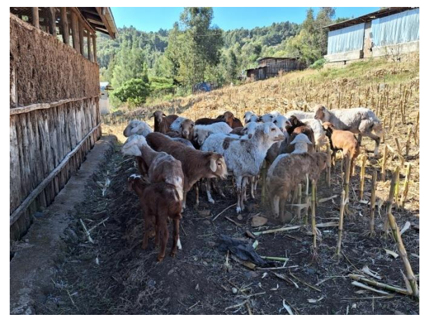
The sheep we have in and out of their shelter