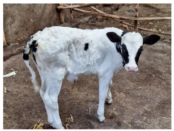
the male calf