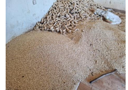
Maize/corn crop produced for the Gondar demonstration site