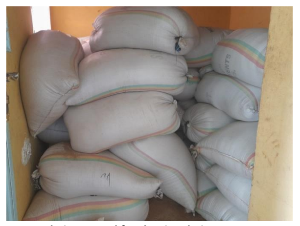
... being stored for the time being