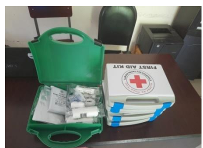
The first-aid Kits bought to be used by our group-home children