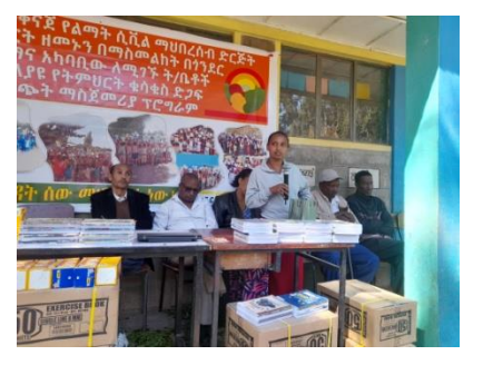
Speech made by the deputy manager, by house speaker and by education department representative