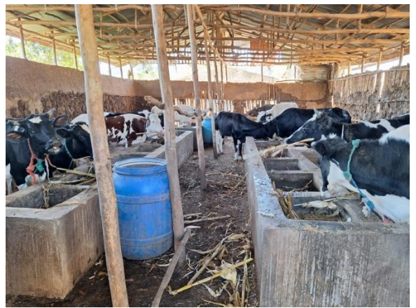
in their shelter