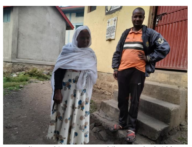
Standing on his own now, while was a bed-ridden