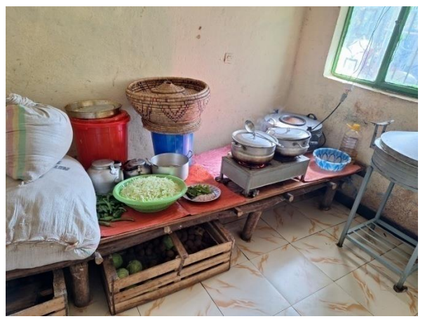
The kids' food stuffs in the warehouse