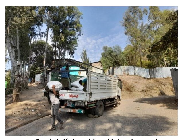
Food stuffs bought and taken to warehouse