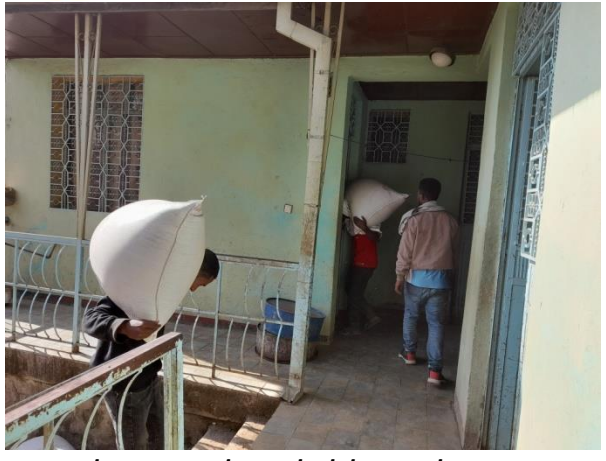
...taken to warehouse by labor worker