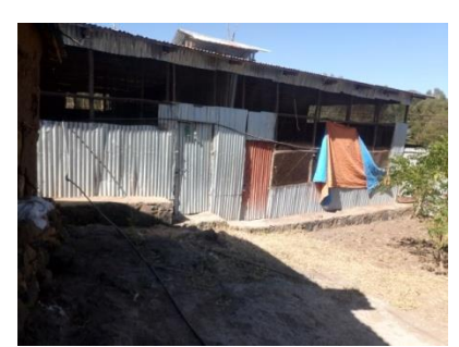
The shelter of the farm

A total of 3,759 laid eggs were collected within the quarter period and we were able to earn ETB 25,460.00 only out of sold ones.