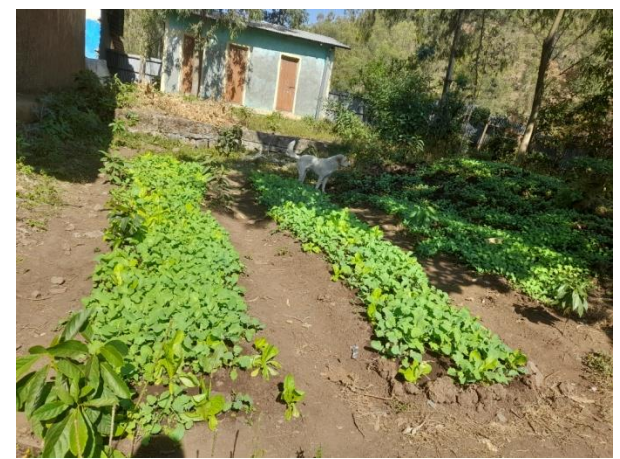
Different vegetable seed-lings to be re-planted in the garden