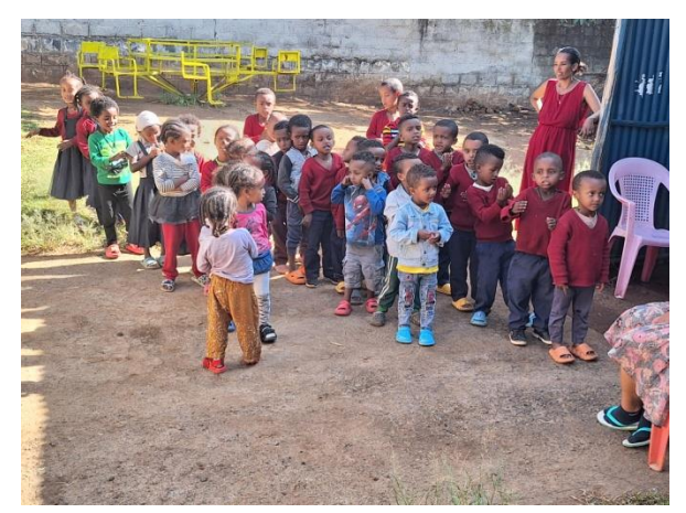
The new comer kids with the older ones in the Center