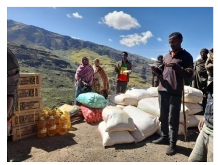
When food stuffs and school materials were being distributed to different feeding schools and centers