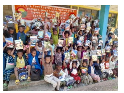
Finally, all selected students in the school, were provided with school materials by Yenege Tesfa Staff