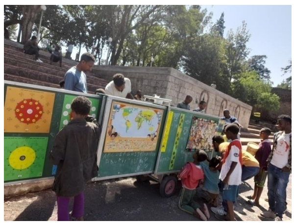
Street children practicing mobile school activities at one of the sessions