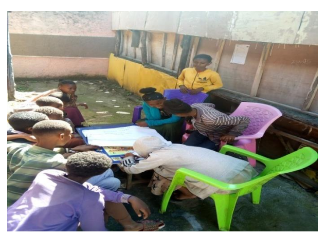
Young street adults during their group work discussions