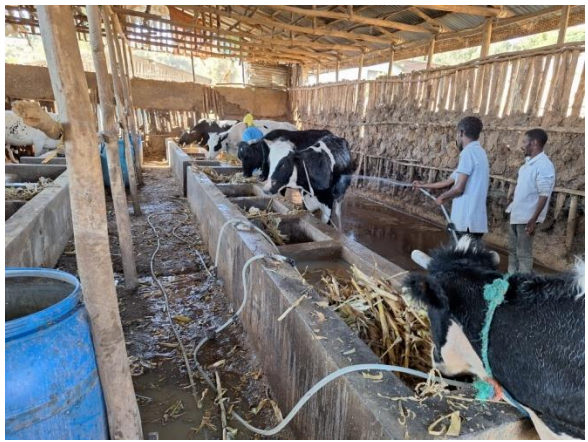
While cleaning the cows