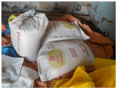
Chicken's food purchased & stored