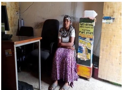
Some, among seriously sick patients but treated and recovered ones, in Kalen Binakafil organization