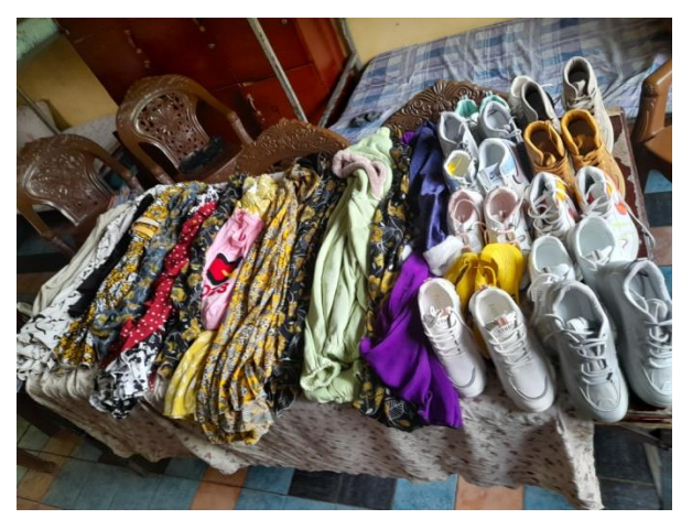
Clothes and shoes, which were given to our children