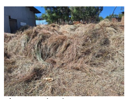
The natural food for animals grown and collected in and around the demonstration site