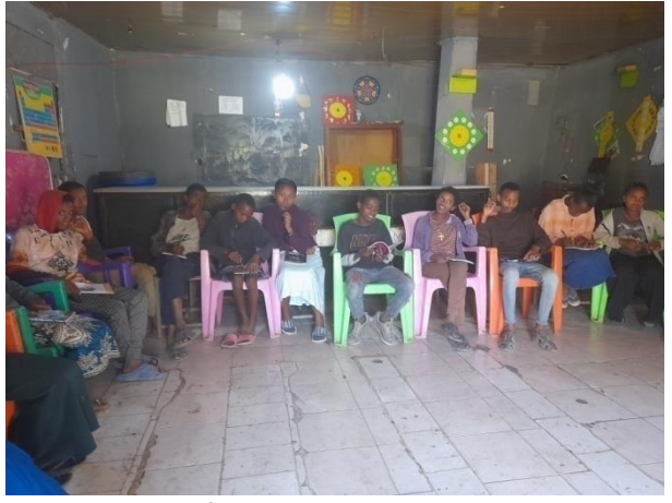
Young adults discussing on issues they concentrate for the session