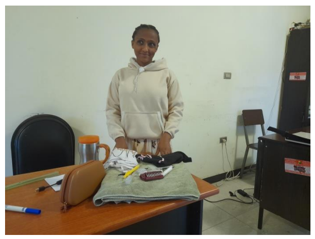
A brave student supporting his group-home mates One of the group-home girls who joined university