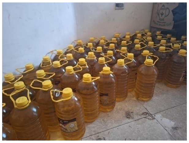
Cleaning and sanitation materials and bottles of food oil in the warehouse to be distributed to group-homes