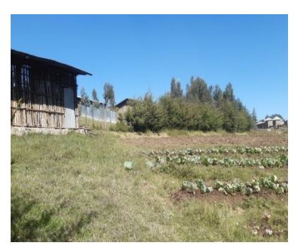
The Debark's agricultural demonstration site