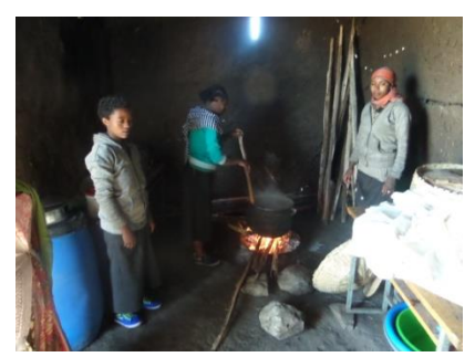
Samples of photos taken when food was being prepared