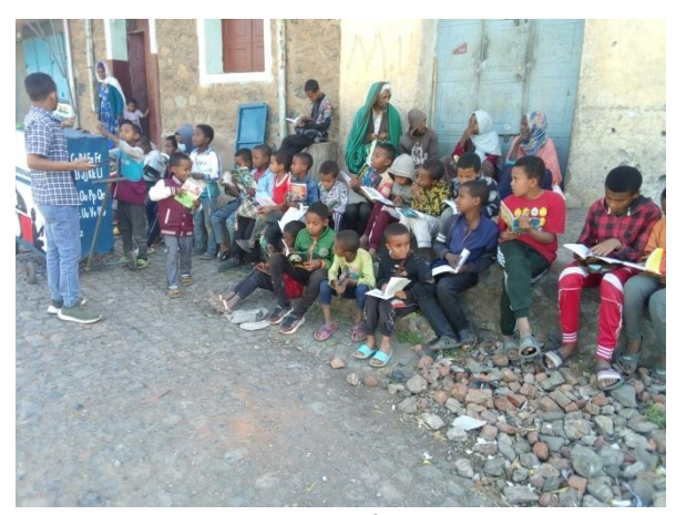
Street children at on of the library sessions