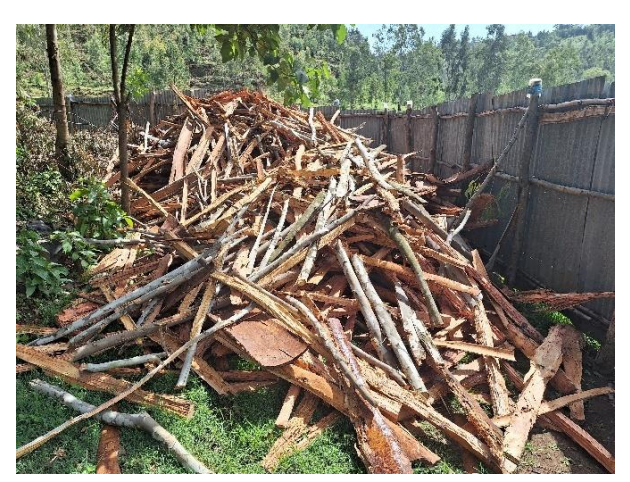
Fire wood being chopped to be given to group-homes for cooking