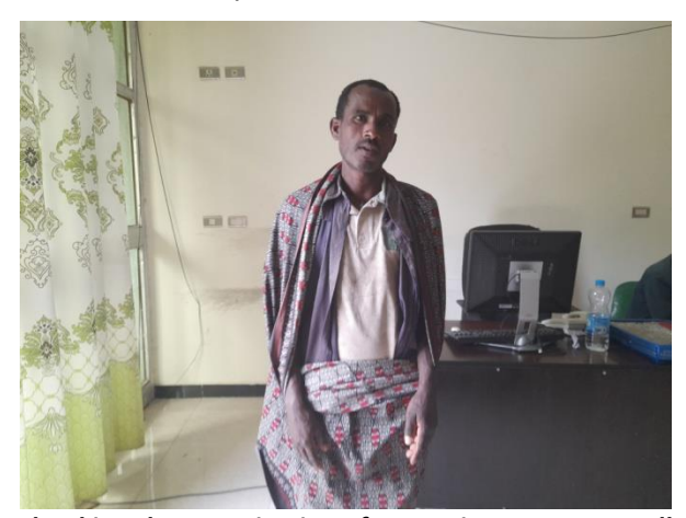
Thanking the organization after getting strong to walk