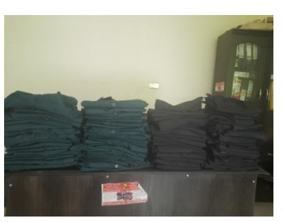
White-blue and green color shirts with black color trousers uniforms